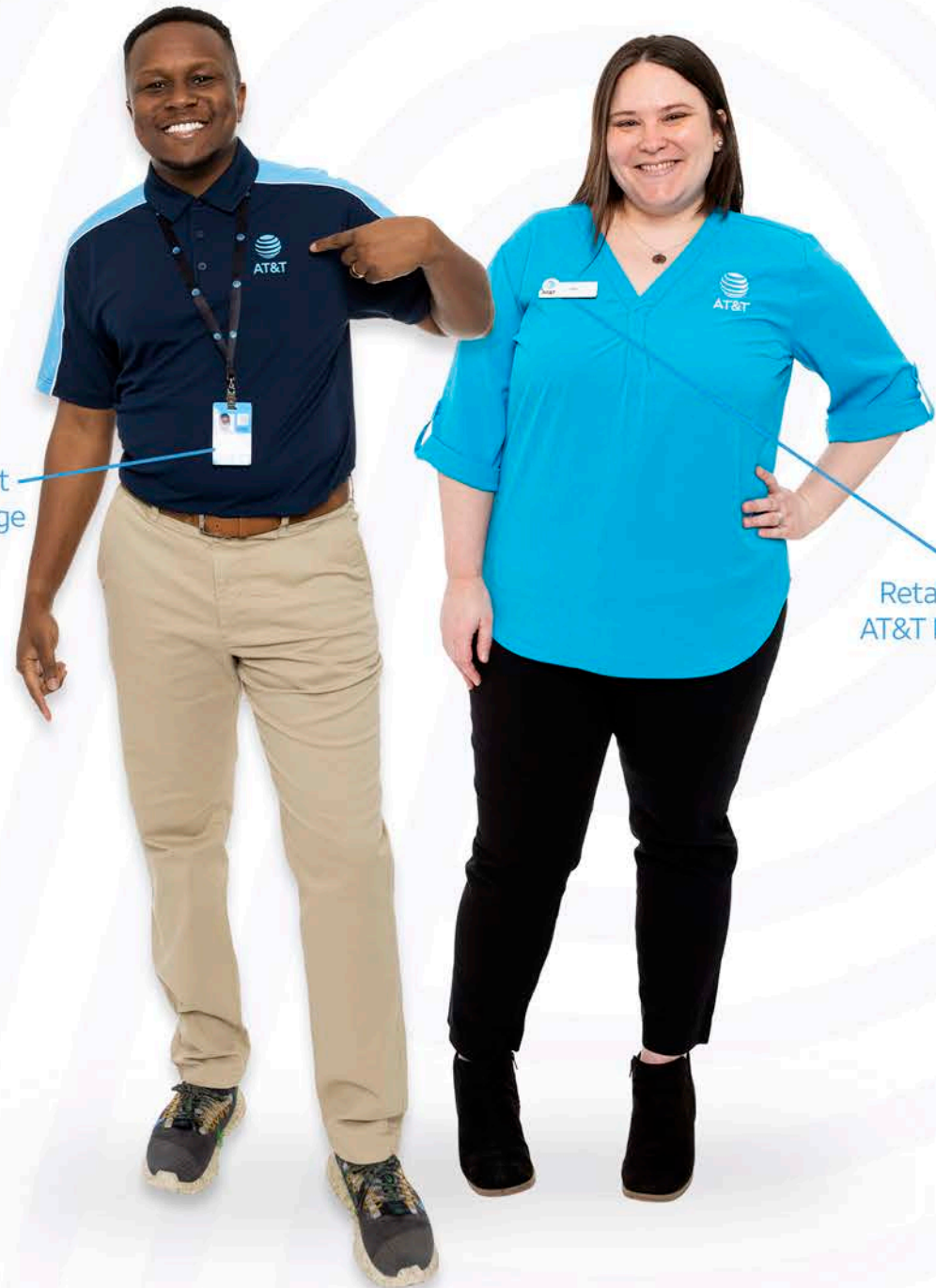
Retail Expert AT&T Name Tag